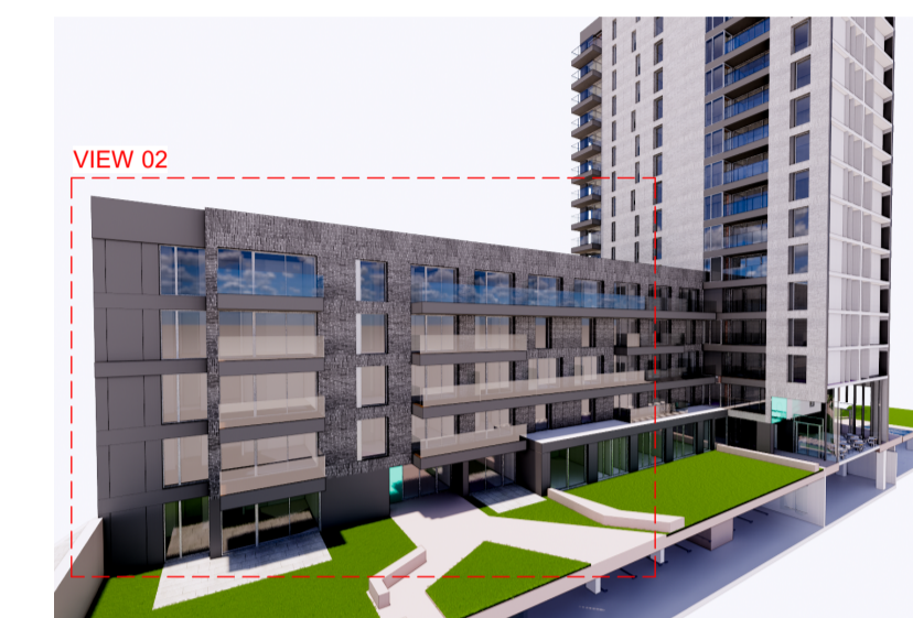
KEY VIEW - BLOCK C