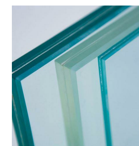
GL-02 Safety glass balustrade system