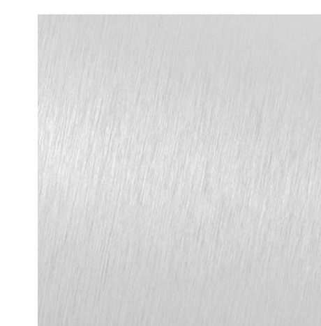
MW-02 Anodized Aluminium frame/spandrel panel with satin silver grey finish